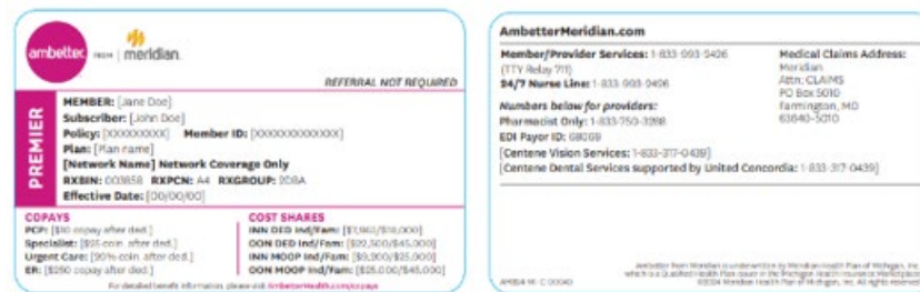
(The above is a reasonable facsimile of the Member Identification Card)

All members will receive an Ambetter member identification card. Below is a sample member identification card. The ID cards may vary due to the features of the health plan selected by the member.