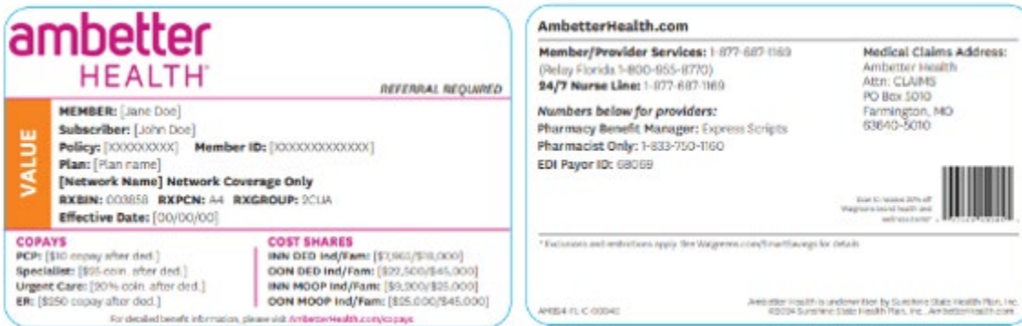
(The above is a reasonable facsimile of the Member Identification Card)

NOTE: Presentation of a member ID card is not a guarantee of eligibility. Providers must always verify eligibility on the same day services are required.